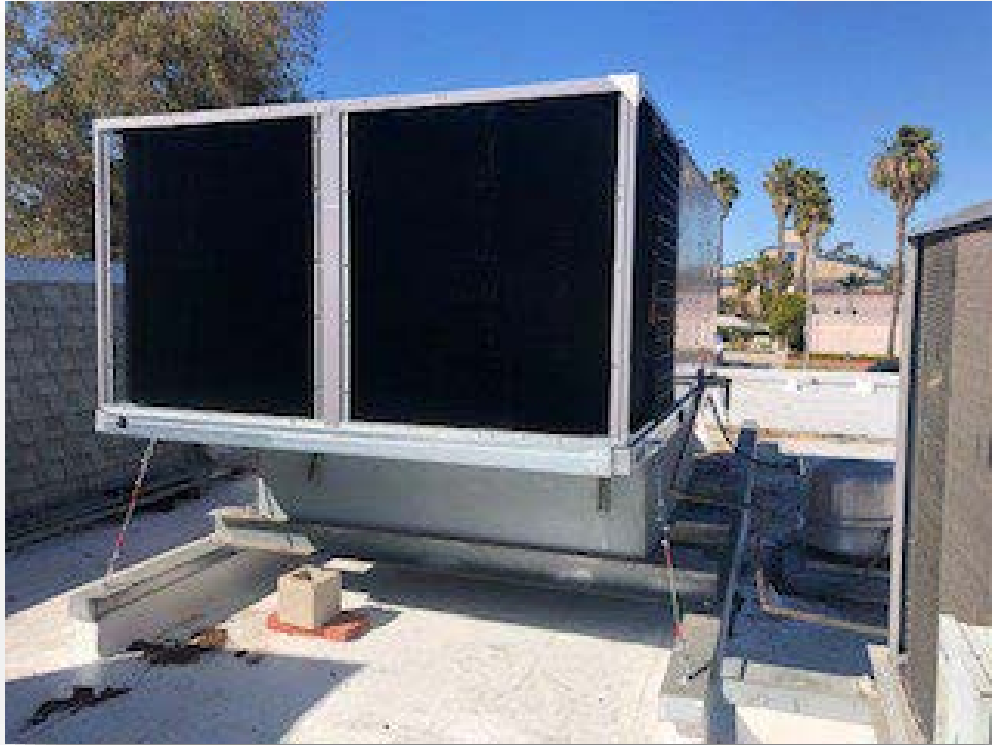
San Diego American Indian Health Center Health Center Improvement and ADA Upgrades