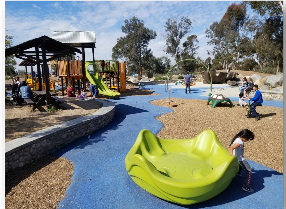
Chollas Park Playground Park & Rec Department