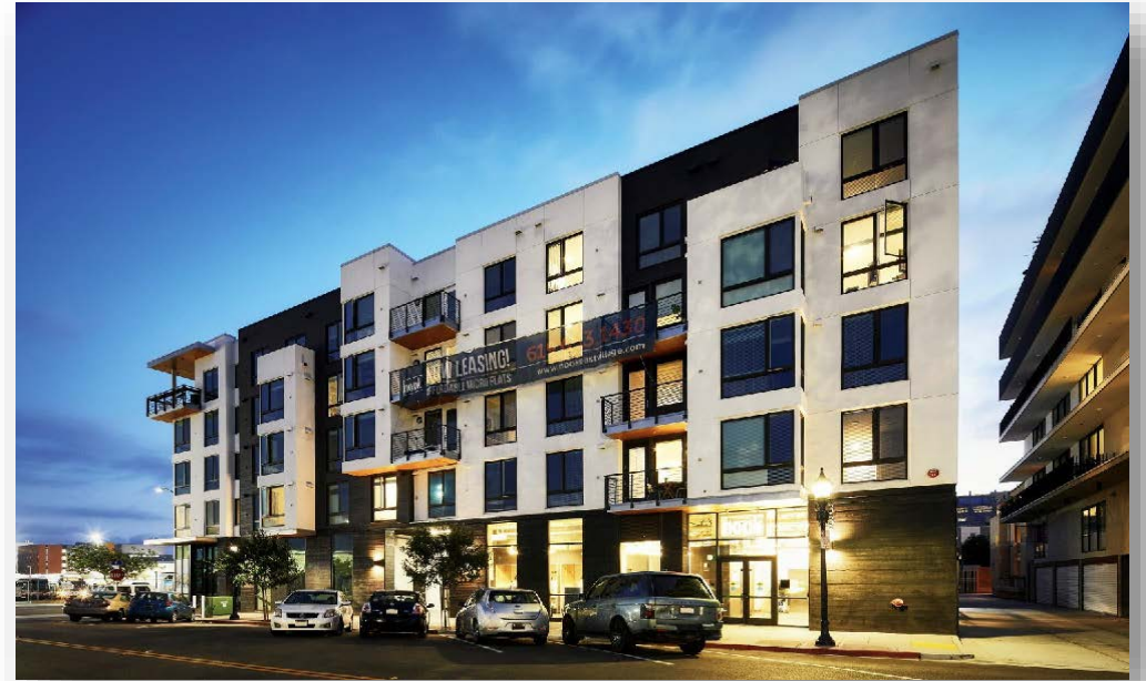
The Nook Developed by: Trestle Development