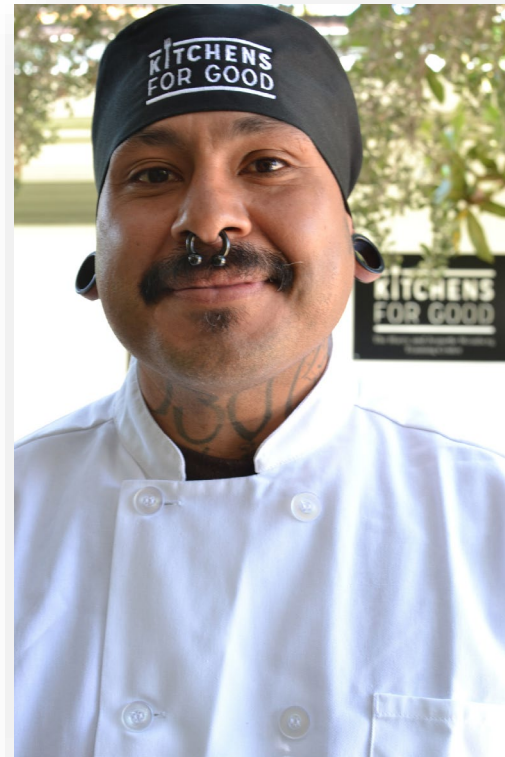
Project LAUNCH Kitchens for Good