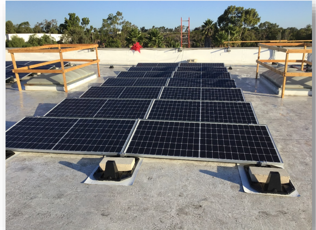
Arc of San Diego North Shores Solar Project