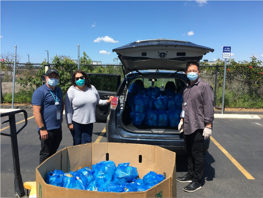
Bayside Community Center Bayside Social Services