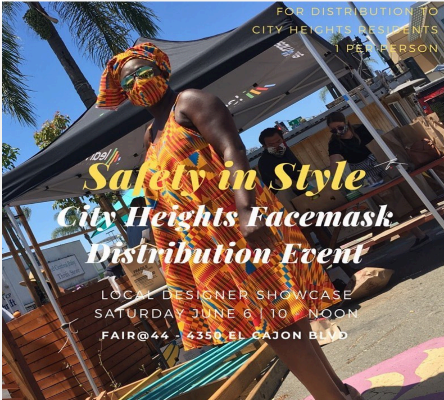
Low-Income Entrepreneurship Assistance Program Supported by International Rescue Committee