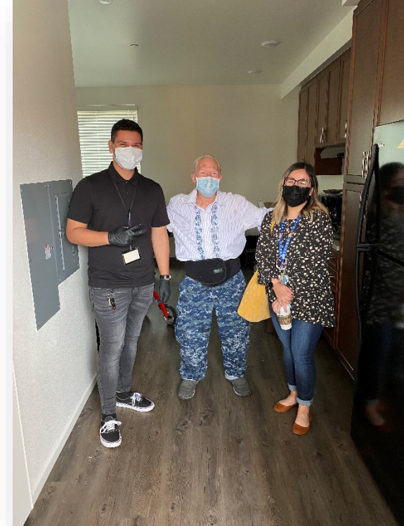
Homelessness Services and Programs Housing Navigation