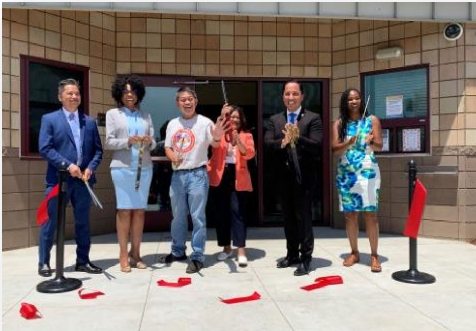
Bay Terraces Community Center Park & Rec Department