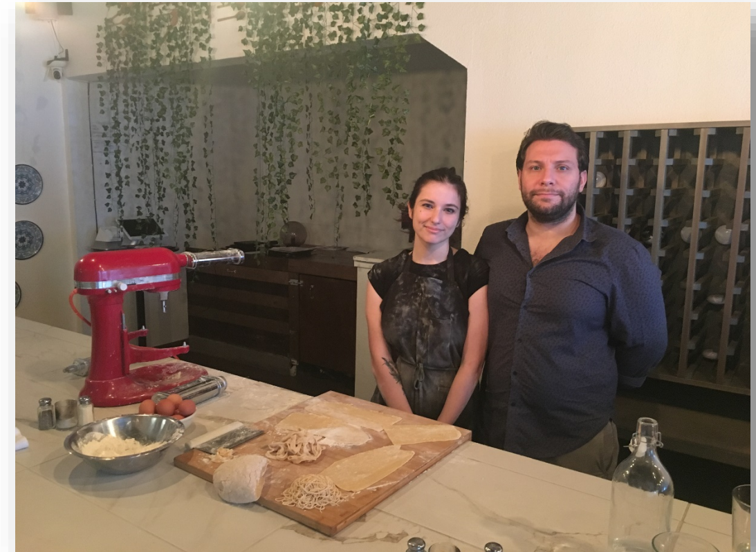
Mattarello Cooking Lab Supported by Accessity (formerly Accion San Diego)