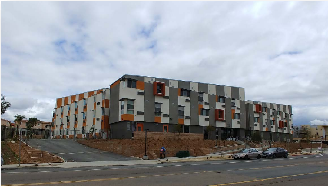
San Ysidro Senior Village Developed by: National CORE