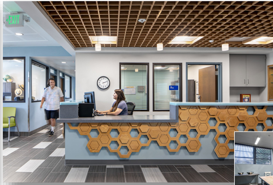
Park de la Cruz Community Center Park & Rec Department