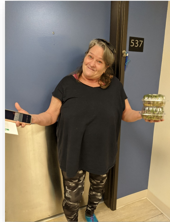
Urban Growth Urban Growth CSA