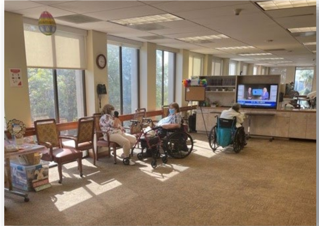
St. Paul's PACE Reasner Improvements