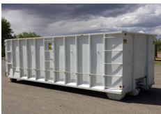
Containers 15 Cubic Yards and Greater

Containers 15 Cubic Yards and Greater, Drag on Tractor, 3 Axle Truck, Front Packer, Side Packer, Rear Packer, Pup Trailer, End Dump, Semi